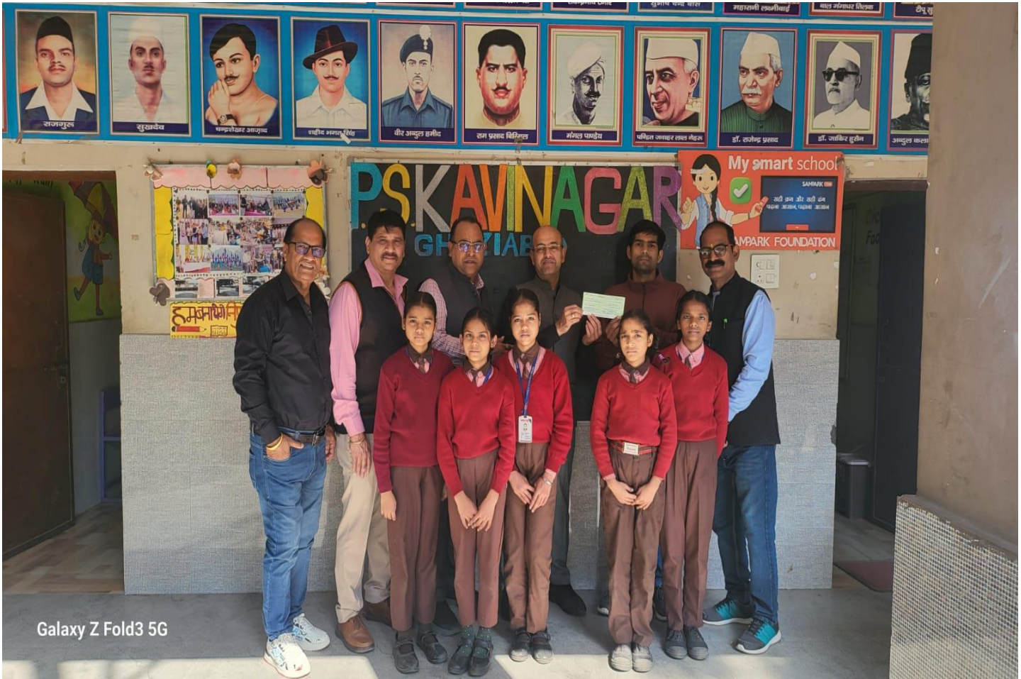
Galaxy Z Fold3 5G