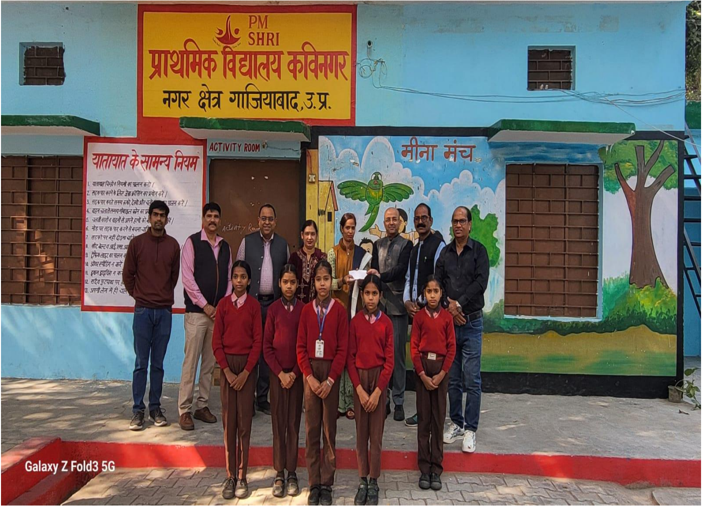
Galaxy Z Fold3 5G